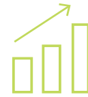
Increase efficiency in sales and operations.