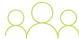
Improve the communication and process between teams and customers